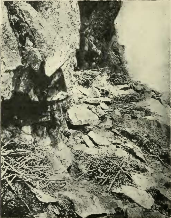
White-crested Cormorant ( Phalacrocorax dilophus cincinatus ). A ledge colony at the foot of a precipice.

used were such as might have been found upon the island, and the grass seemed to correspond to that within a short dis-